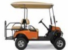
S4 HIGH OUTPUT