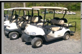
2010 EZGO RXV - Gas $4095