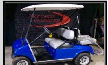
2005 Club Car DS - Gas $4795