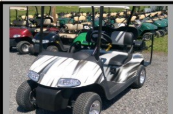
2011 EZGO RXV - Gas $5495