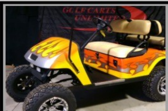
2006 EZGO TXT - GAS NOW $4995