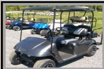
2002 EZGO TXT - Gas $4695