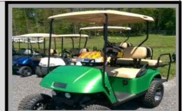
2005 EZGO TXT - Gas $4995