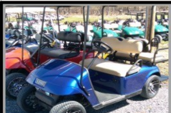
2006 EZGO TXT - Gas $4995

Serving Western Pennsylvania for over 23 years