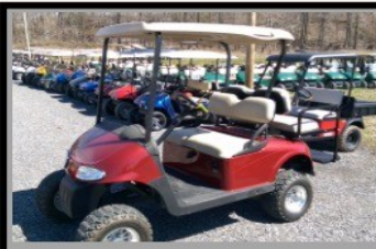
2010 EZGO RXV - Gas $5595